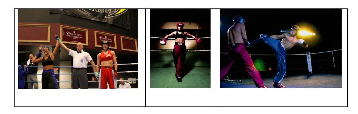
Appendix 2: 10oz Gloves